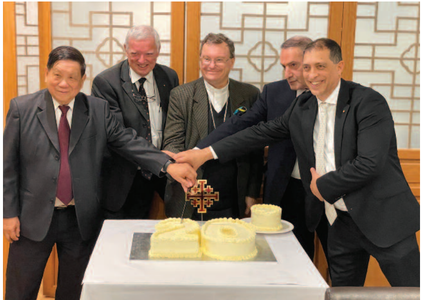
The birthday cake for the 20 th anniversary of the Lieutenancy for South Australia.