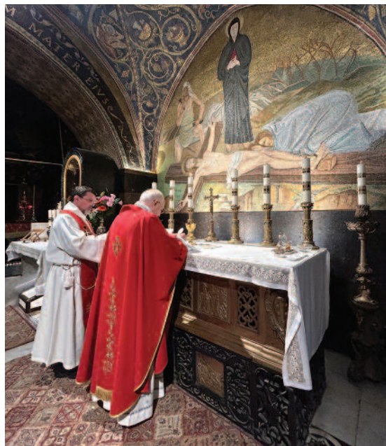
Cardinal Filoni, pictured celebrating Mass at Golgotha on 3 January 2024, invites us to constantly pray for peace without giving way to discouragement.

This is what a Knight and a Dame of the Holy Sepulchre can do in support of their solicitude for the Land of Jesus in these times.