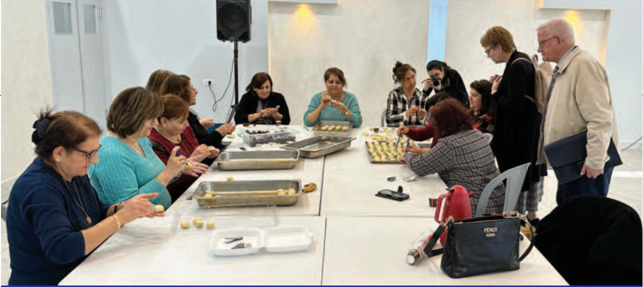
Economic conditions in the region are very difficult, therefore some women in Beit Sahour parish produce, wrap and sell traditional sweets, the proceeds of which are donated to the local school to support school fees.