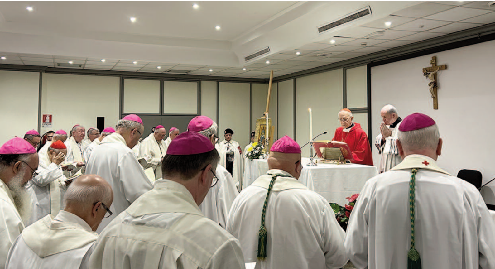
Morning Mass presided over by the Grand Master and concelebrated by the Grand Priors present at the Consulta of the Order, in November 2023.

and as is well known, Pope Francis recently (2020) updated its Constitution.