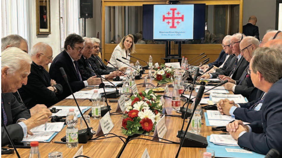
The Governor General led the meeting of the Grand Magisterium, the main theme of which was support for the Mother Church of Jerusalem currently facing the serious humanitarian consequences of the war.

electricians, tilers, etc.). The Patriarchate also covers the medical costs of a large number of uninsured patients and provides humanitarian aid to thousands of needy people. The school network (44 schools