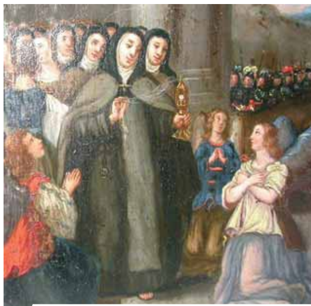
Ancient depiction of the Miracle of Saint Clare