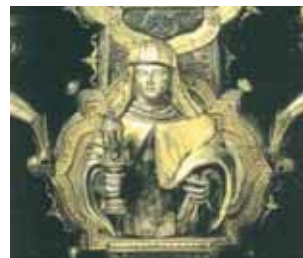
Saint Clare , detail of the great Cross of Gianfrancesco dalle Croci