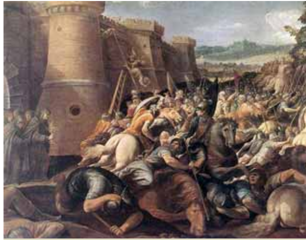
Saint Clare and the Assault on Assisi , Giuseppe Cesari (1568-1640). Hermitage Museum, St. Petersburg

The History of Saint Clare, Virgin, tells of various miracles performed by Saint Clare. There are episodes of multiplications of loaves, of bottles of oil that appeared in the convent when there was none before. But Clare performed the most famous of the miracles in 1240, on a Friday in September, in which she turned away an attack by Saracen soldiers who had broken into the convent cloister by showing them the Sacred Host.