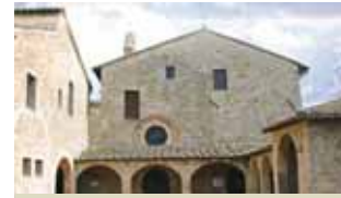
Convent of San Damiano in Assisi