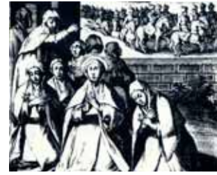
Enrico de Vroom (1587), Miracle of Saint Clare