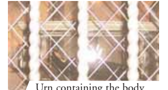
Urn containing the body of Saint Clare, Assisi