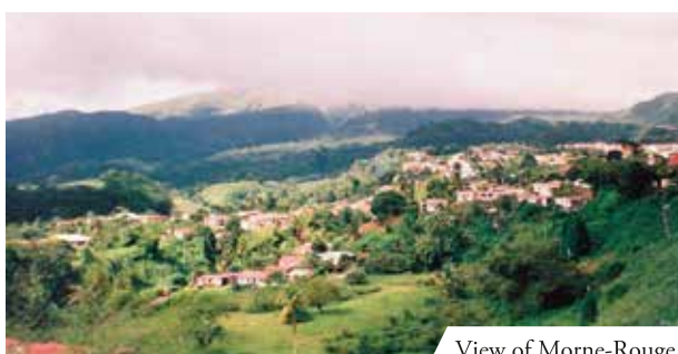
View of Morne-Rouge