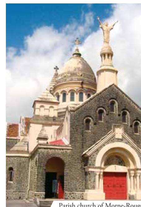
Parish church of Morne-Rouge