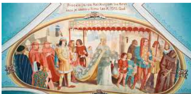
Fresco depicting the procession held in Rome in 1513, in which Pope Leo X is carrying the precious relic through the city streets