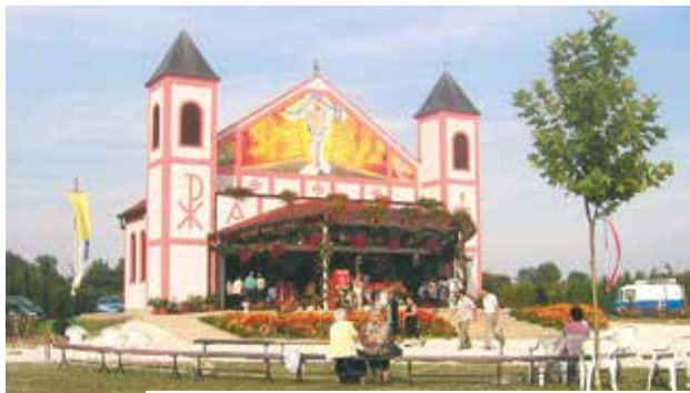
Shrine of the Miracle of the Precious Blood, Ludbreg