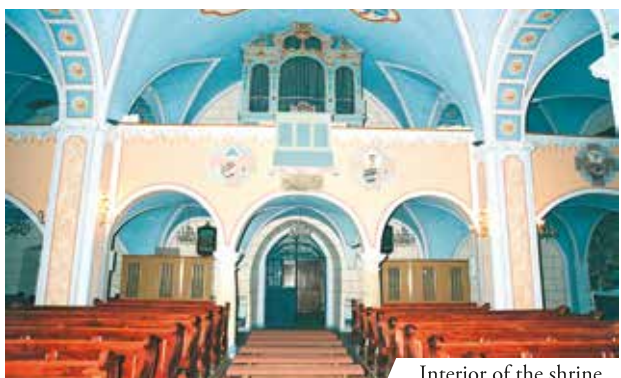
Interior of the shrine