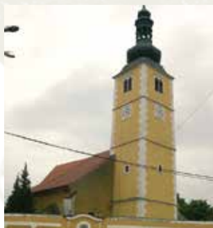
The chapel of the Batthyany family castle where the miracle occurred