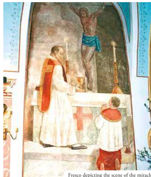
Fresco depicting the scene of the miracle

In 1411 at Ludbreg, in the chapel of the Count Batthyany's castle, a priest was celebrating Mass. During the consecration of the wine, the priest doubted the truth of transubstantiation and so the wine in the chalice turned into Blood. Not knowing what to do, the priest embedded this relic in the wall behind the main altar. The workman who did the job was sworn to silence. The priest also kept it secret and revealed it only at the time of his death. After the priest's revelation, news quickly spread and people started coming on pilgrimage to Ludbreg. The Holy See later had the relic of the miracle brought to Rome, where it remained for several years. The people of Ludbreg and the surrounding area, however, continued to make pilgrimages to the castle chapel. In the early 1500s, during the pontificate of Pope Julius II, a