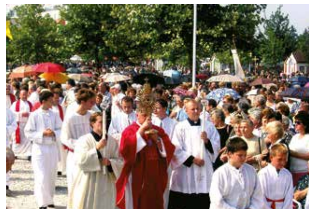
Procession held every year in September, during the week when the miracle called Sveta Nedilja is celebrated