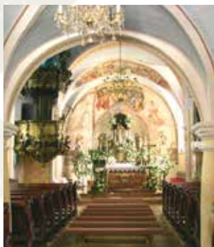
Interior of the chapel of the Batthyany family castle