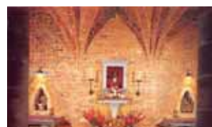
Sanctuary of the Holy Blood, Reliquary Chapel