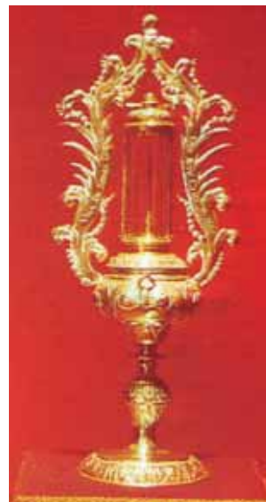
Reliquary of a Thorn from the Crown of Jesus