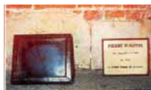
Picture of the altar where the curé of Haut-Ittre celebrated the Holy Mass where the miracle was verified