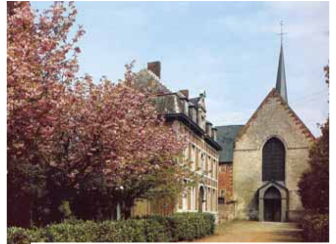
Premonstratensian Abbey, Chapel of the Holy Blood