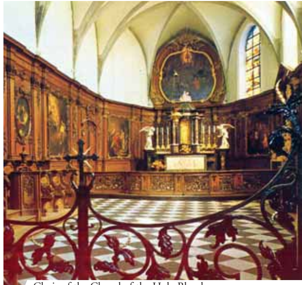
Choir of the Chapel of the Holy Blood

On January 13th, 1424, Pope Martin V approved the building of the Monastery of Bois-Seigneur-Isaac. Today the monastery is the goal of pilgrimages. The corporal stained with blood is exposed to view in the chapel.