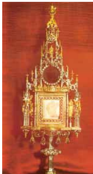
Reliquary of the Eucharistic miracle, corporal stained with blood