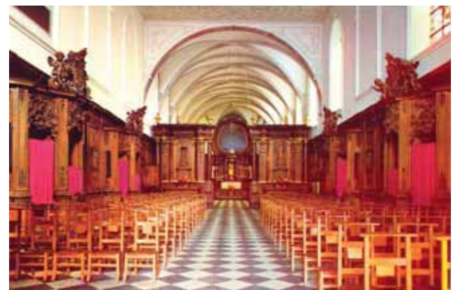
Interior of the Chapel of the Holy Blood